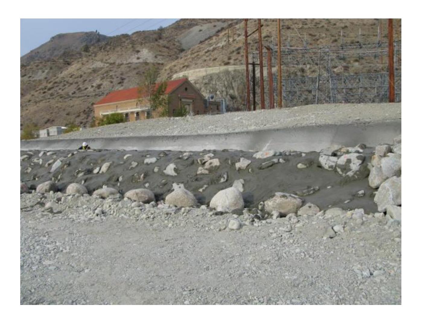
Conveyance canal overflow spillway section under construction, 10/30/08. Boulders have been installed and grout was placed this day.