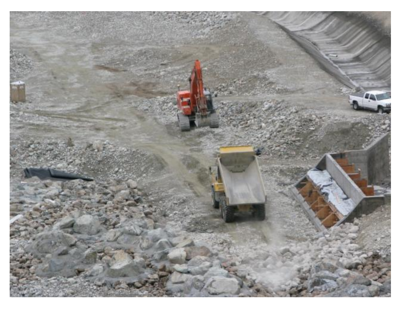
Picture taken on 11/3/08. Concrete for the pumped water outlet structure has been completed, and forms are still in place. Rock embankment material placement is underway.