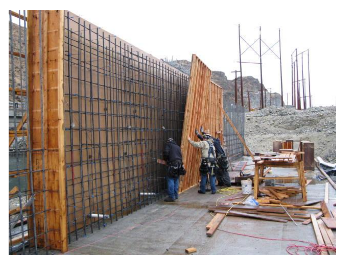
Pump station foundation slab and grade beams have been placed. Retaining wall forms and rebar underway. 11/4/08